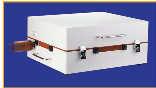
Compact Chamber Clamshell Model

Note: See Compact Chamber Clamshell data sheet