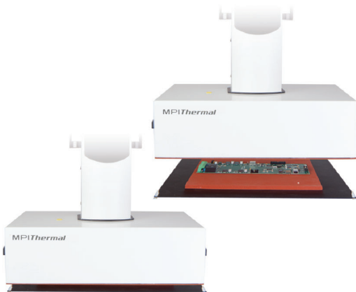
Hood Compact Chamber up/down on test component