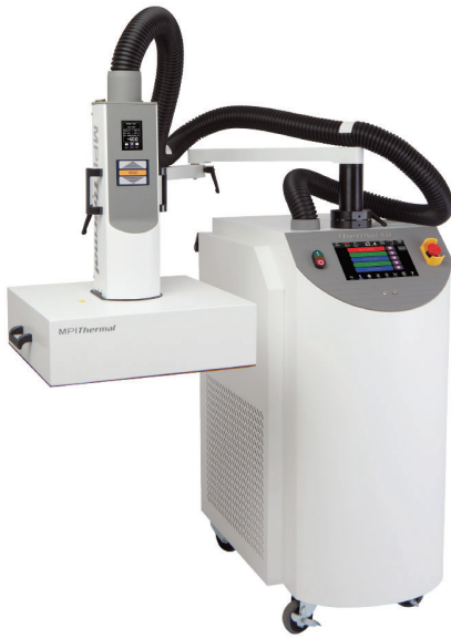
TA-5000A with Compact Chamber Hood